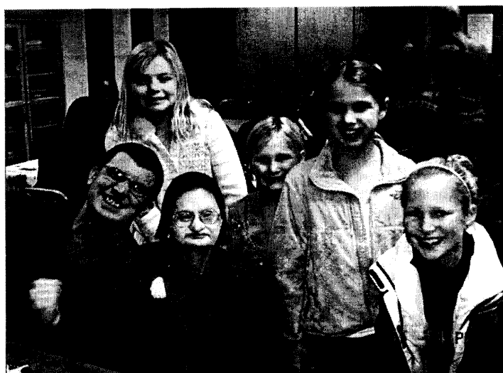
Our Church Friends

We are extremely grateful for their genuine interest in twelve people associated with COC, the friendships that have been nurtured, and the happiness they continue to bring.